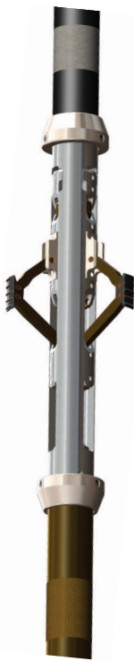
Overbody Extension for 5 1/2" Pipe